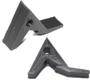
3D Printed Trigger Control Group Travel Reducer (TCGTR) / "Swift Link"