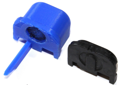
3D printed, Glock-type, MCD / Glock slide cover plate comparison