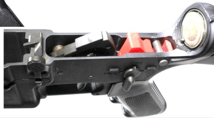
AR-type MCD installed in fire-control cavity