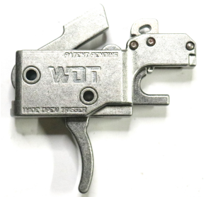
Forced Reset Trigger (FRT)