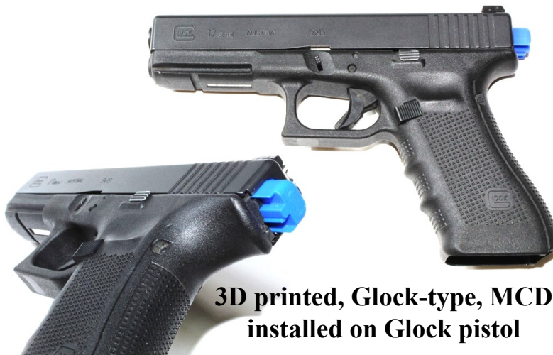
3D printed, Glock-type, MCD installed on Glock pistol