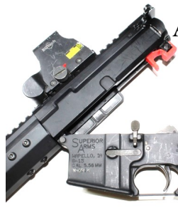
AR-type MCD on lug of upper assembly (left)