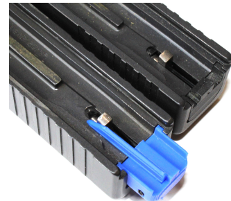
3D printed, Glock-type, MCD / Glock slide cover plate comparison